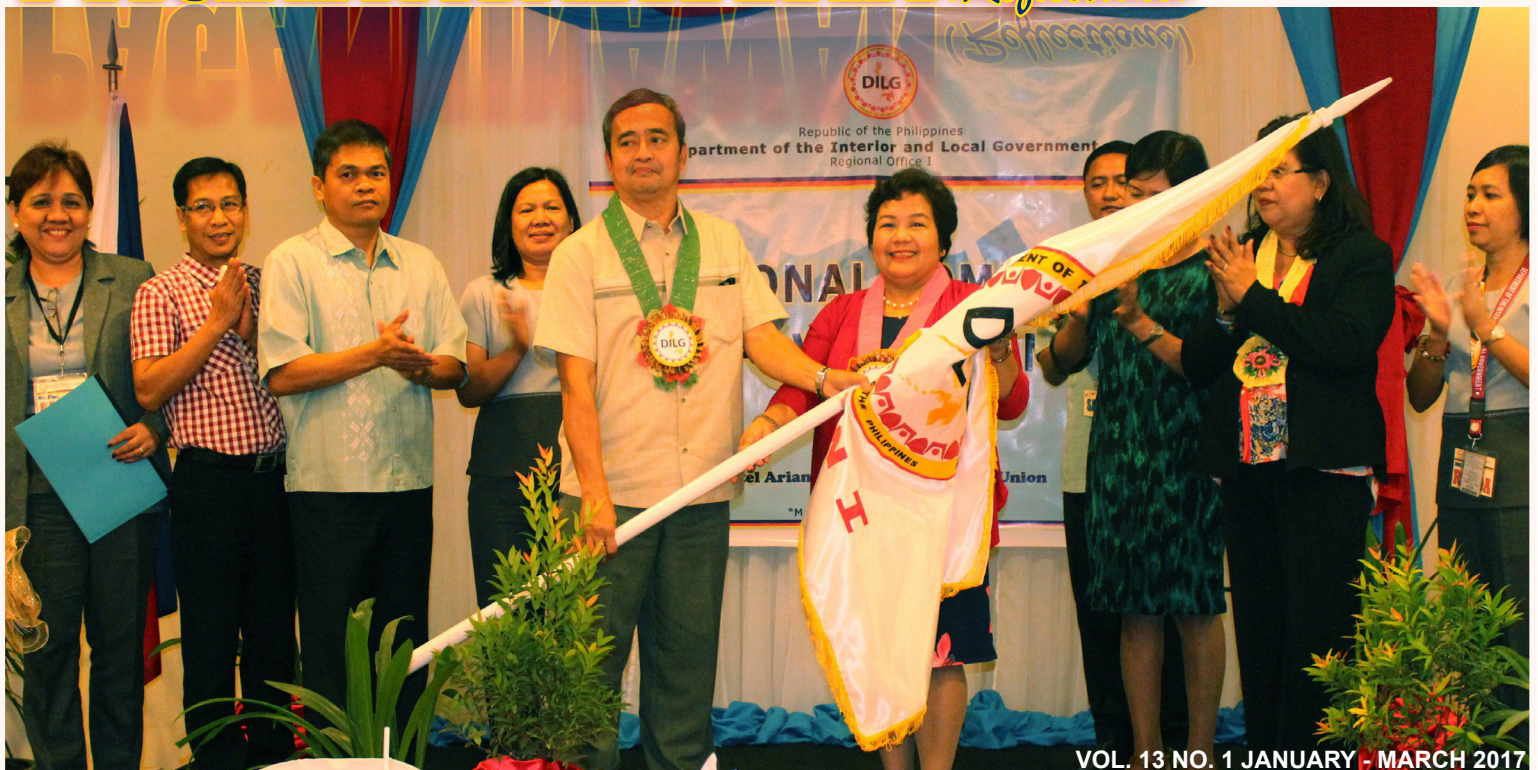
VOL. 13 NO. 1 JANUARY - MARCH 2017