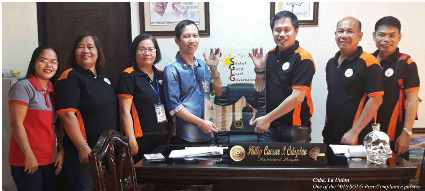
Caba, La Union One of the 2015 SGLG Post-Compliance passers

Forty-seven (47) Local Government Units (LGUs) in Region 1 received the 2015 Seal of Good Local Governance (SGLG) Post-Compliance Markers.